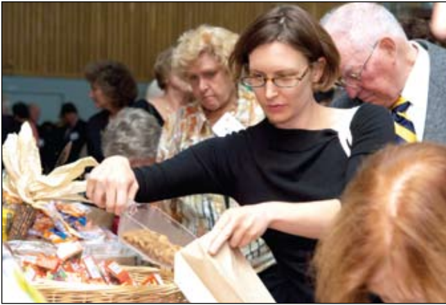
The farmers market offers an array of California foods.