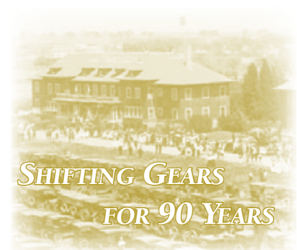
Picnic Day, 1908

This was the campus's 90th Picnic Day celebration. What an event!